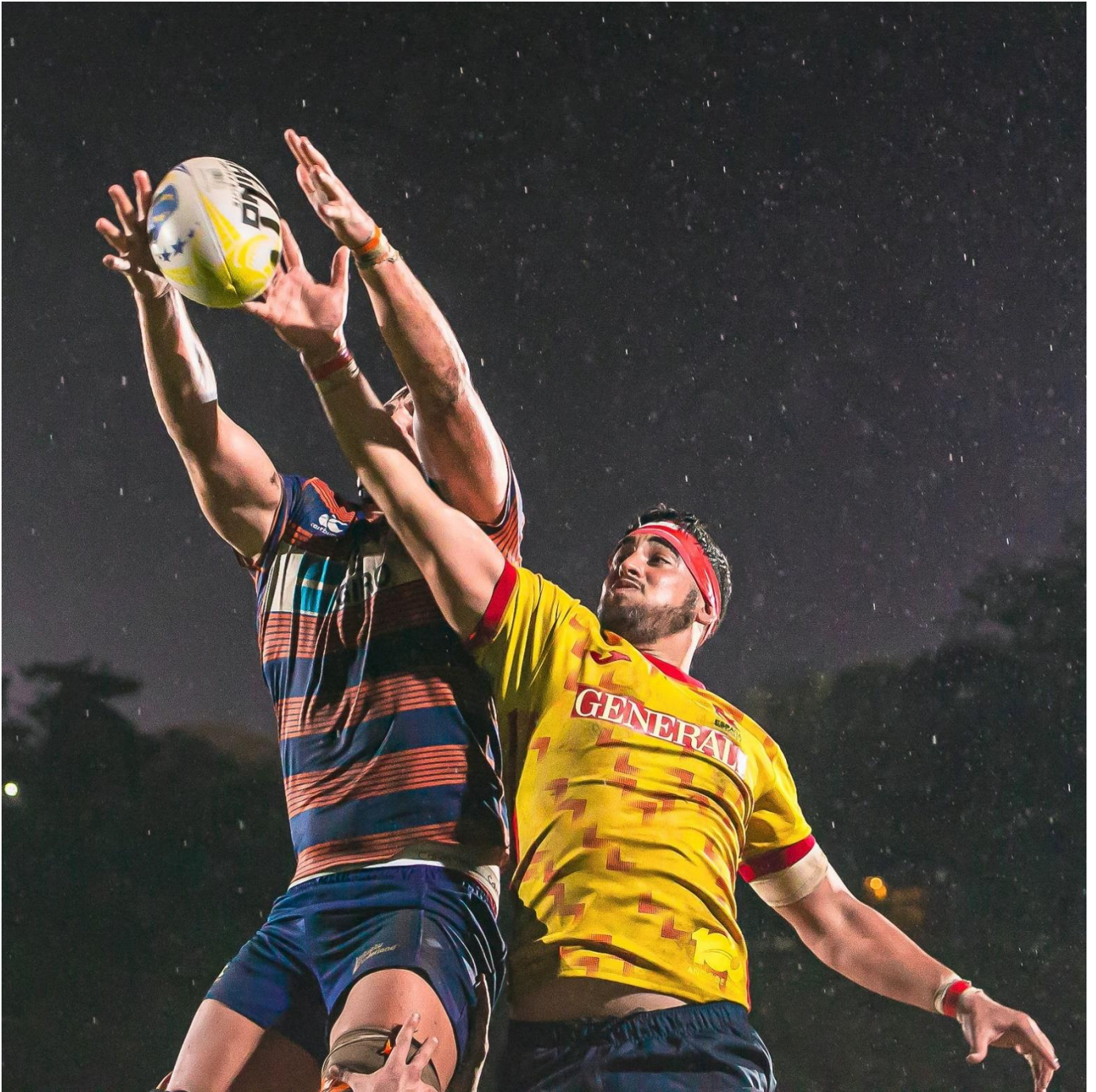
2022 Rugby Europe U20 Championship, Gold Final